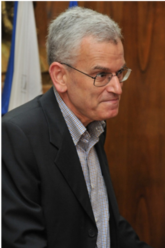
Figure 5 A port trait of Domenico Ribatti.

PlGF treatment inhibited wound healing, extravasation of tumor cells, and growth of a tumor overexpressing the PlGF receptor (VEGFR-1), neutralization of PlGF using blocking antibodies had no significant effect on tumor angiogenesis in different animal models.